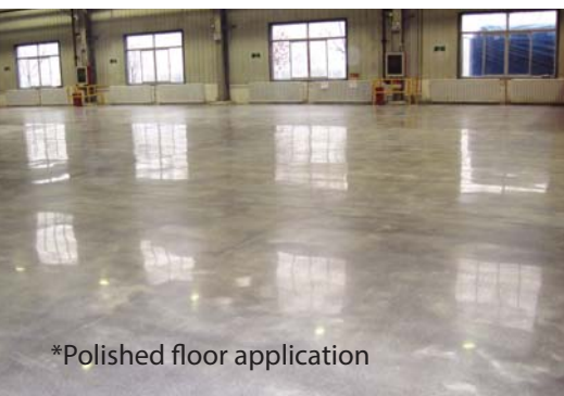
*Polished floor application