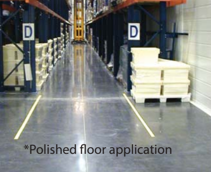
*Polished floor application

LIQUI-HARD is a premier densifier and chemical hardener designed for ultimate hardening and dustproofing of concrete.